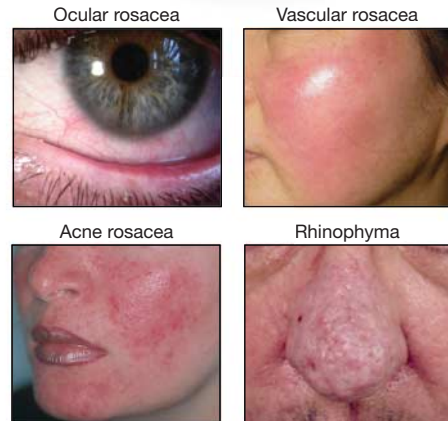
Types of rosacea

Sources: National Institute of Arthritis and Musculoskeletal and Skin Diseases; American Academy of Dermatology; National Rosacea Society